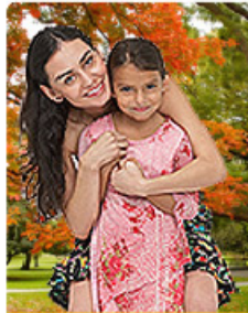
Individuals & Families